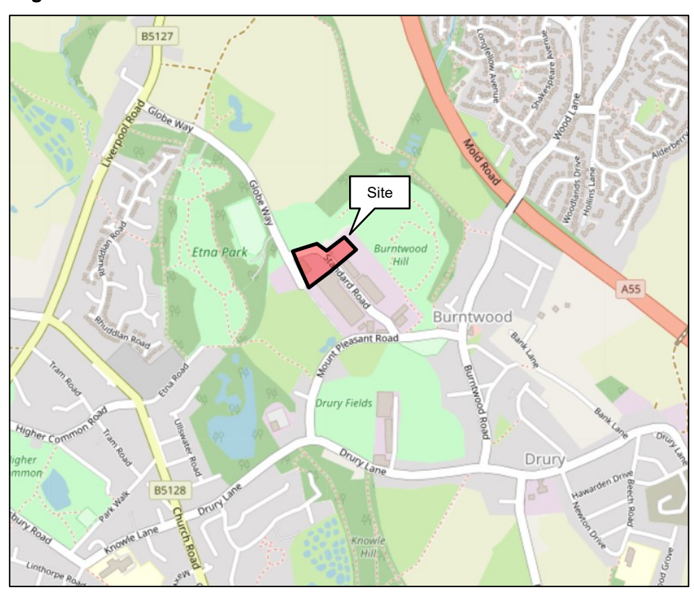
Figure 1: Site Location Plan